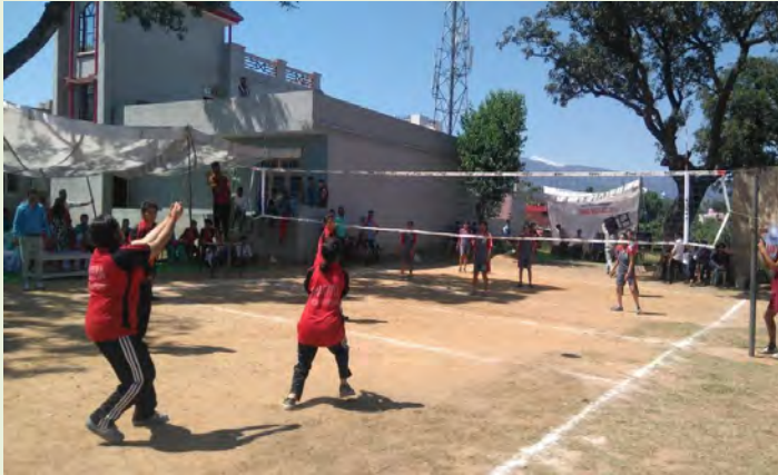
Final Volley Ball Match (Female Category)