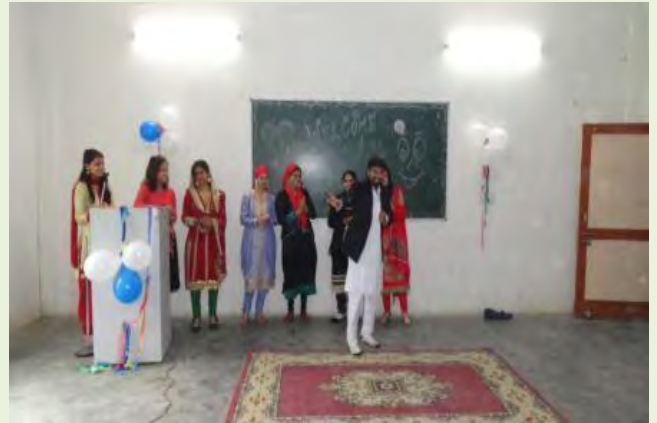
Baisakhi Celebration in College Campus on 13 th April, 2017